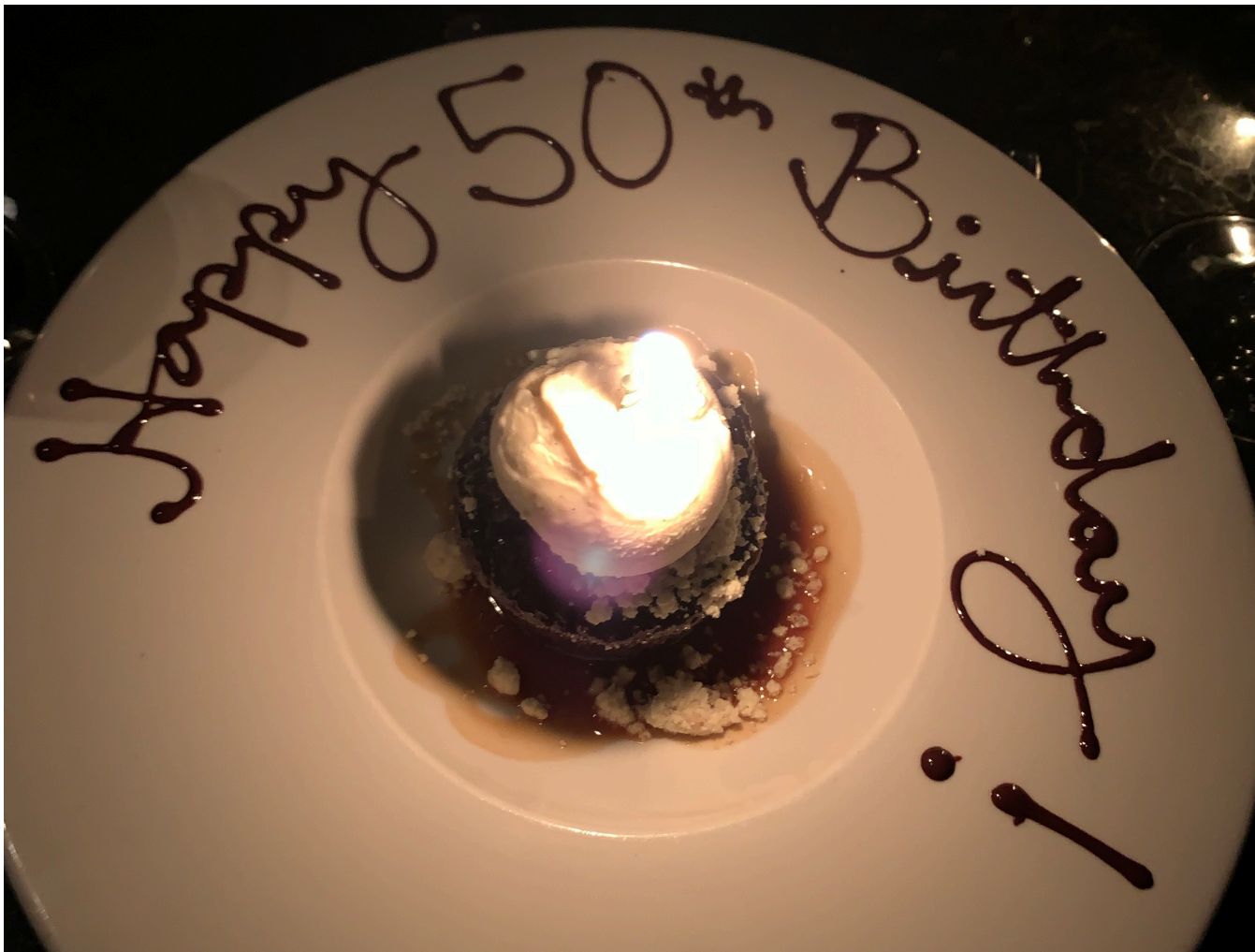
Elements at the Sanctuary on Camelback Mountain, Paradise Valley, AZ

Therefore, beloved, since you are waiting for these [the new heavens and a new earth in which righteousness dwells according to his promise], be diligent to be found by him without spot or blemish, and at peace. 2 Peter 3:14