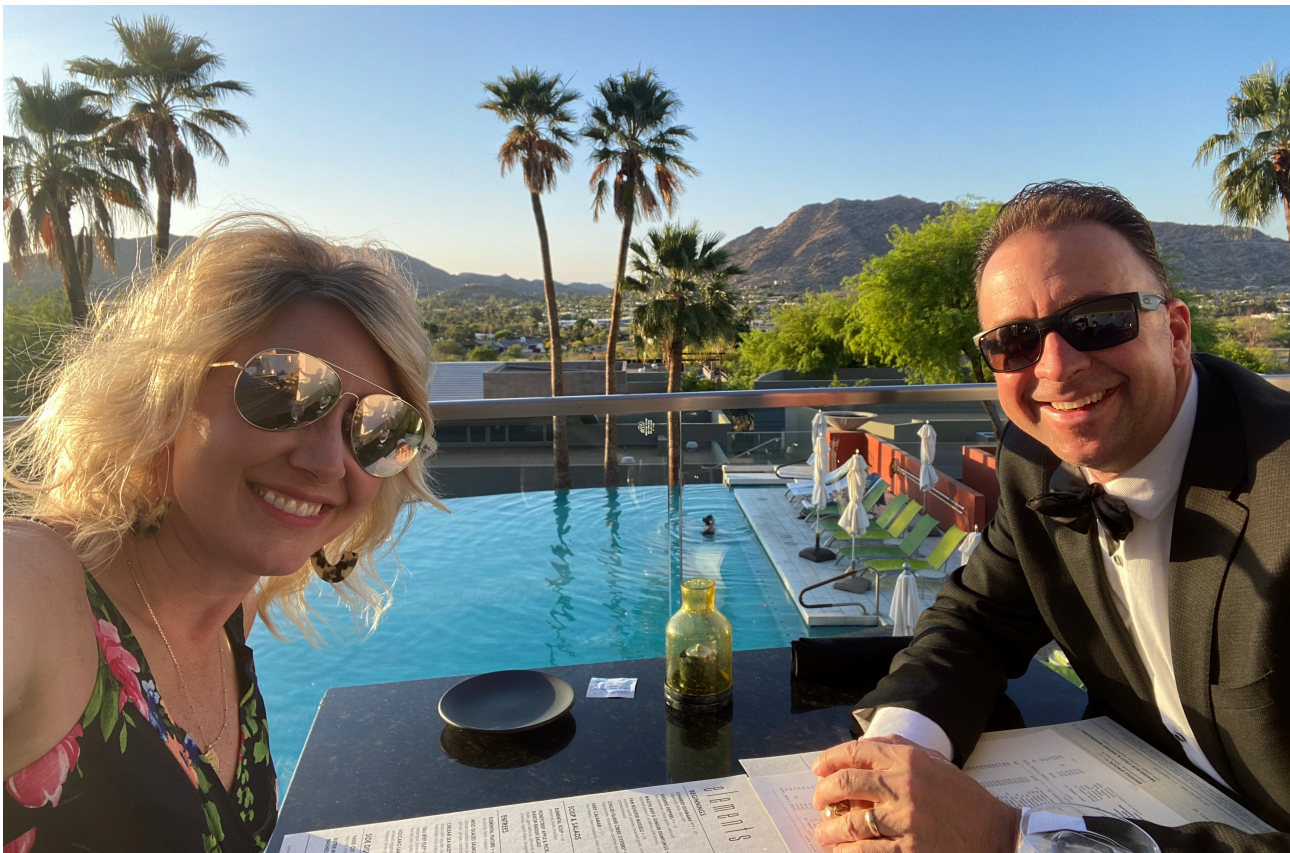
Scottsdale, Arizona, April 2021

1. Are you making regular effort to grow in godliness? Make every effort to grow in virtue - that is the language Peter uses. Many of you have succeeded at great things through hard work. Have you ever put that level of effort into your spiritual growth?