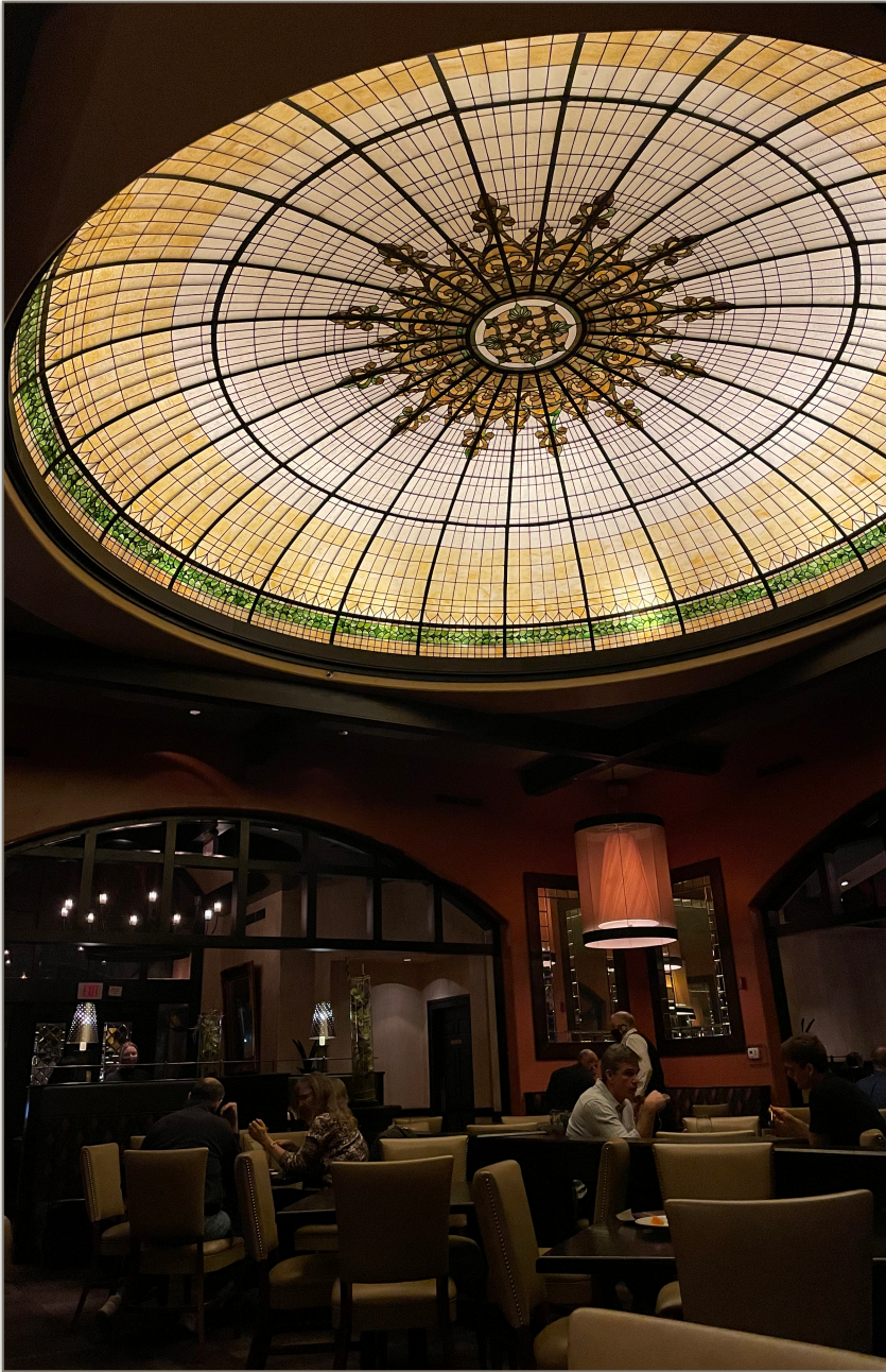
Photo: the Bristol in KC, January 2021