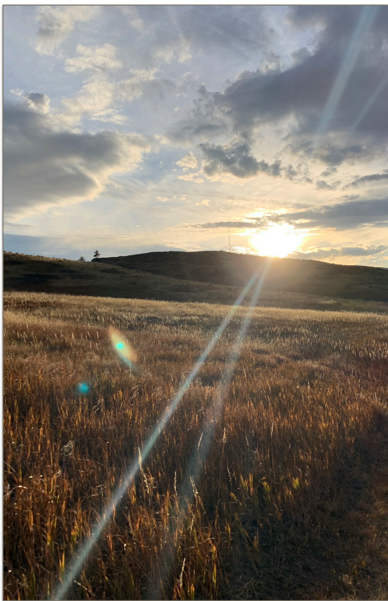
Chadron, NE, Photo taken September 2020

“Christ will return prior to the millennium according to the premillennialist and after this golden age according to the traditional post millennialist. Amillennialism, however, understands the reference to a 1000 year period as figurative for the era between Christ two advents [the “already-not yet