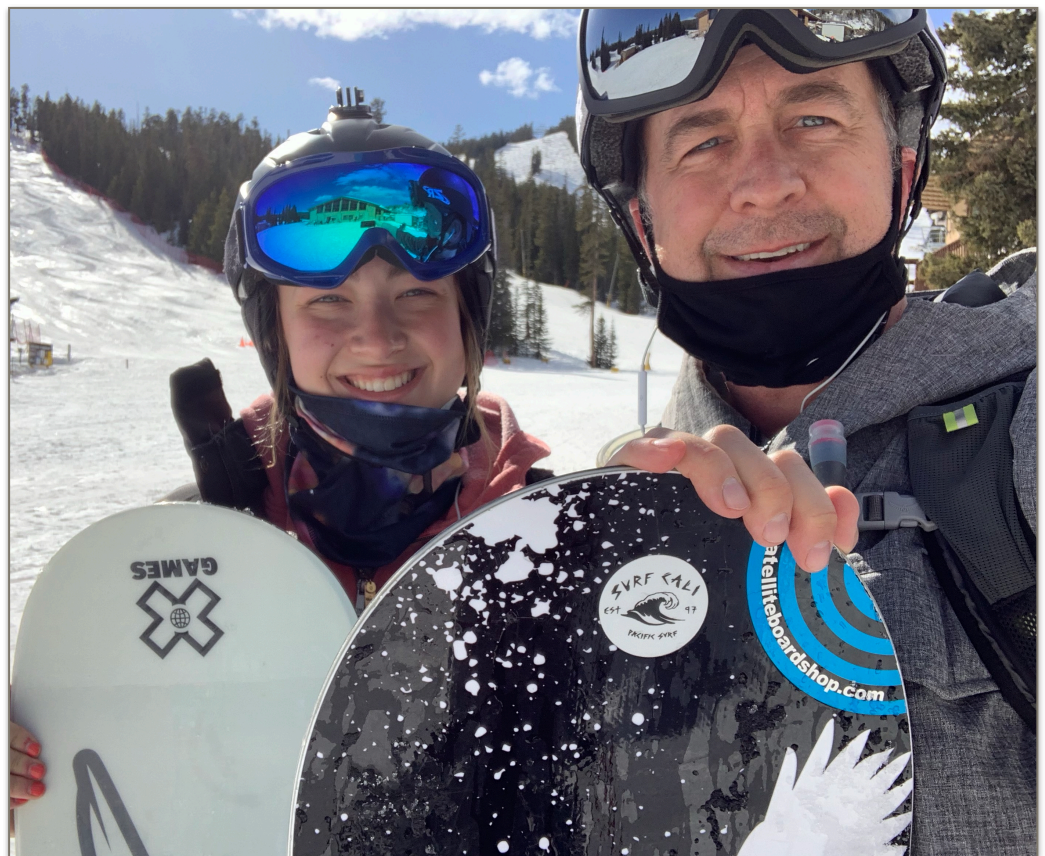
Photo: El Dora trip 4, March 2021

Conclusion: The book of revelation is not confusing about dragons as much as it is very clearly about Jesus. He is worth it. Conquer. Run to him.