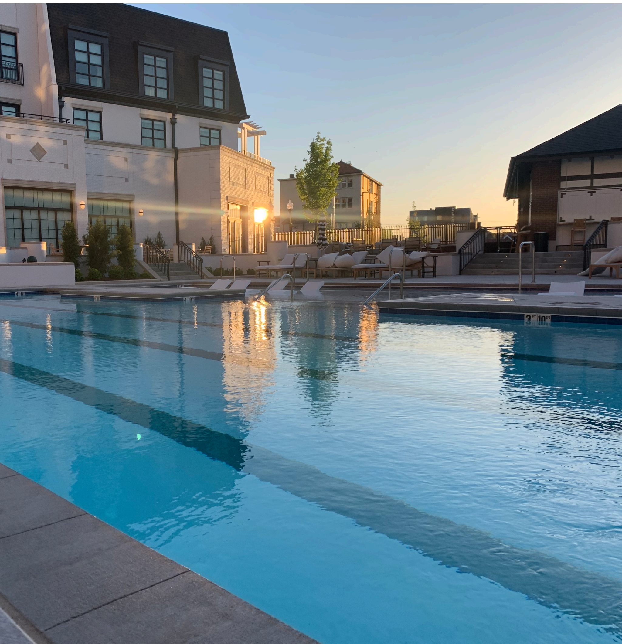
The Cottonwood Hotel, Omaha, NE: Jodi's 50th birthday