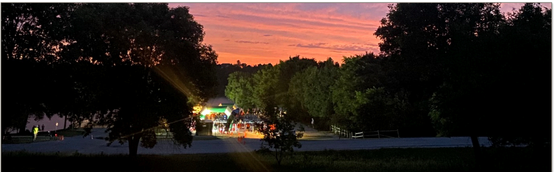
Omaha Triathlon, July 2020