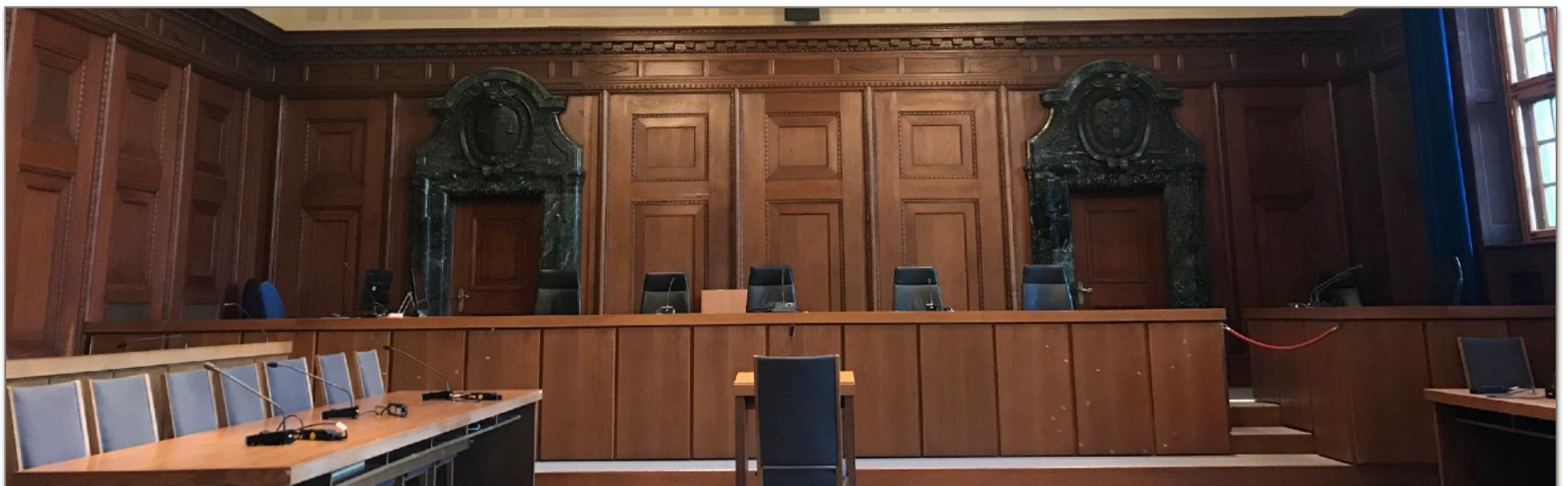
Nürnberg Trials, Germany trip January 2020

But as it is, they desire a better country, that is, a heavenly one. Therefore God is not ashamed to be called their God, for he has prepared for them a city.