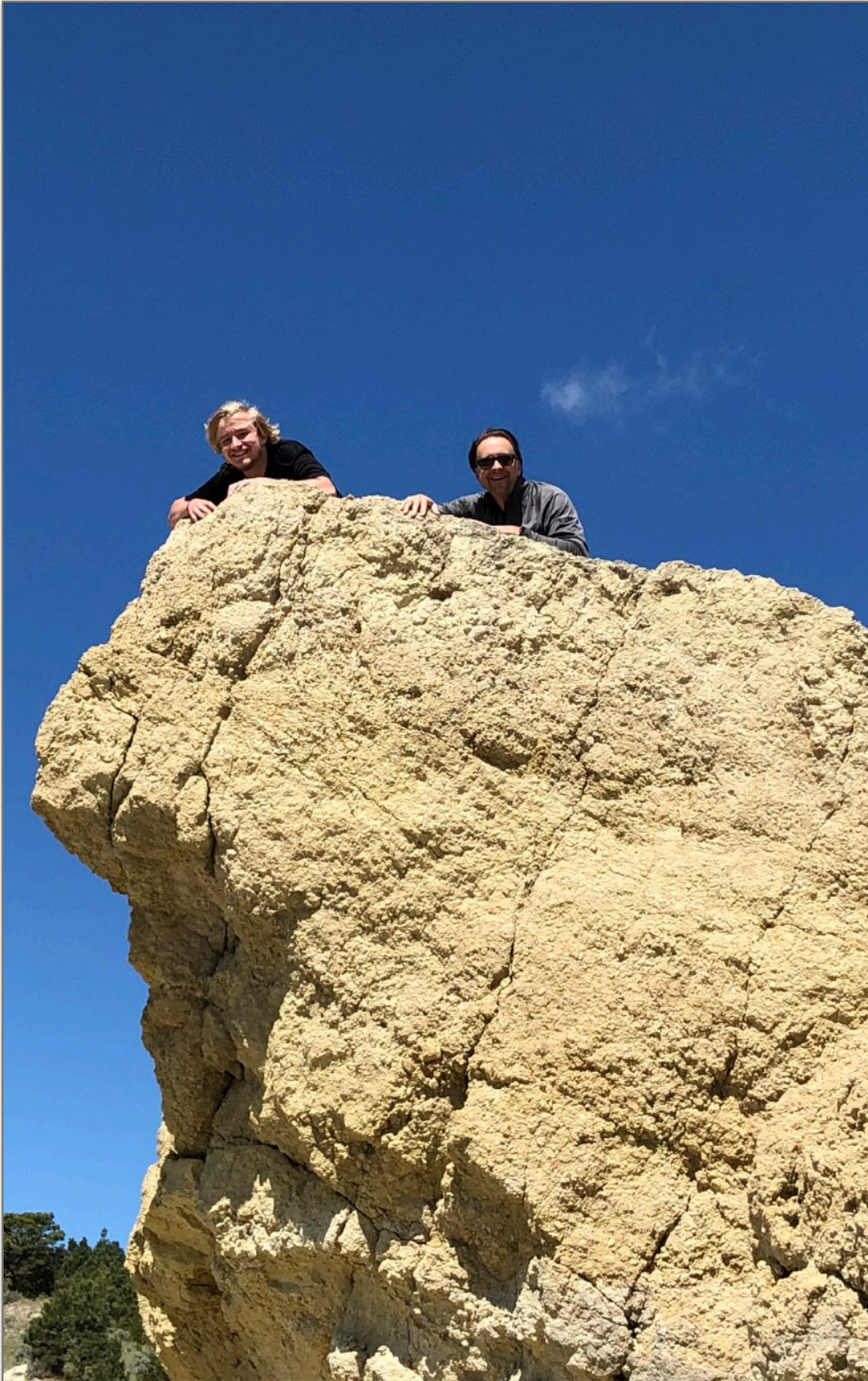
Helena, Montana, May 2020