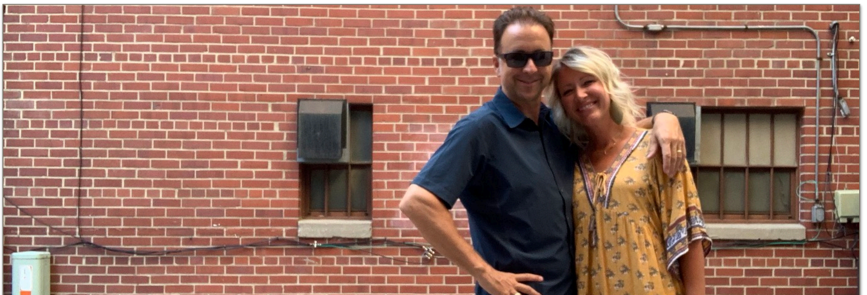
Alto for wine, July 2020