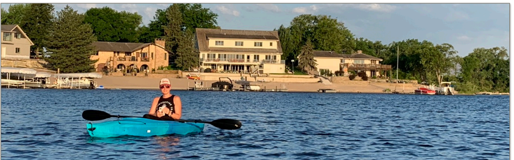
Kayacking, June 2020

B. Sarah's story is one of sorrow. She was barren and lived in shame. She was powerless in herself. Faith does not call us to be perfect but to trust the one who is perfect. Hebrews 11 is about how great God is. This is not really the "Hall of fame of faith" - there is One hero of the story.