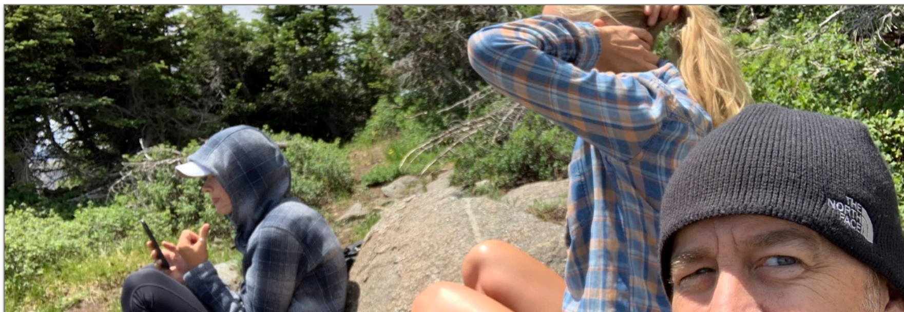
Alto for wine, July 2020

Strategy 1: Throw off all weight and sin. Will it help you run, not only is what you are considering to do sin? Serious runners get rid of every resistance. What is it that is holding you back from running this race more passionately? Bitterness? Respectable sins like overwork and family idolatry. What is the problem? It keeps us from the full weight of joy in following Christ.