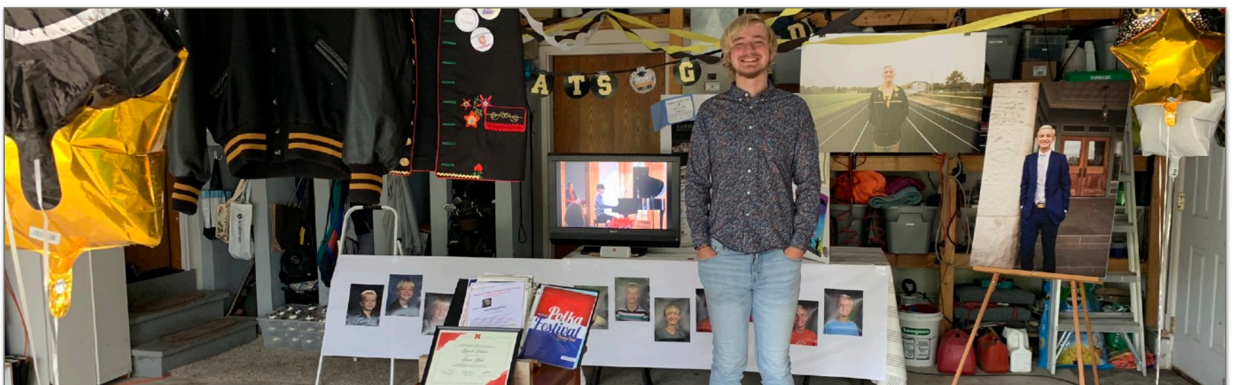
Drive Up COVID Graduation Party, May 2020